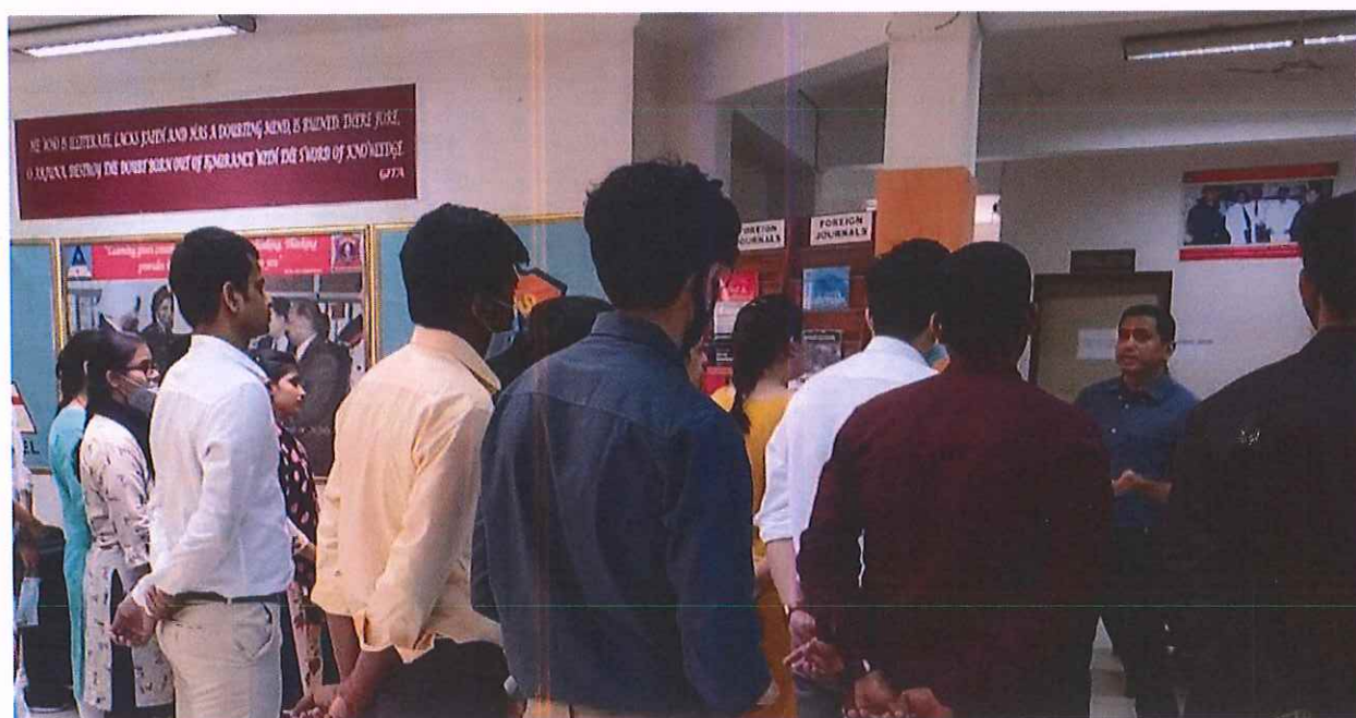
Orientation to Library Resources