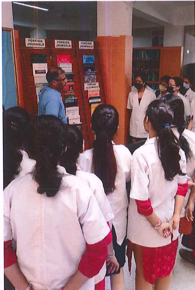
Students Learning the importance of Journal Reference