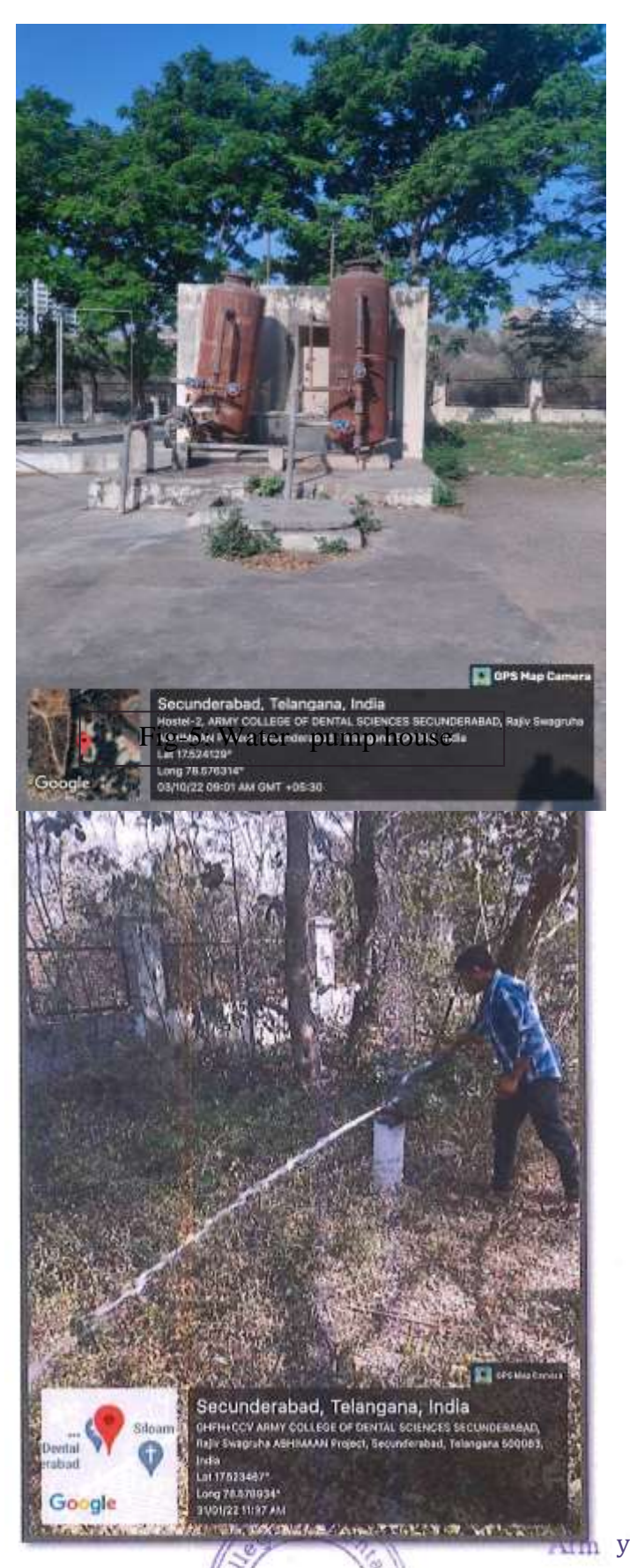
Fig-6: Borewell n college c amp us

PHINCIPAL y College of Dental Sciences uodeiabad-500 087.