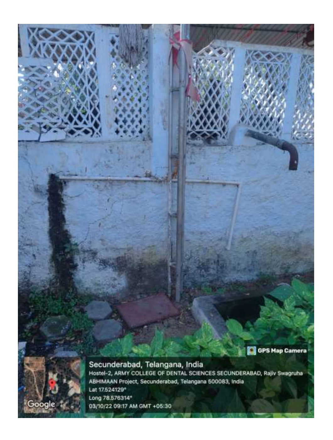
Fig-22: Water pipe line distribution at Mandir