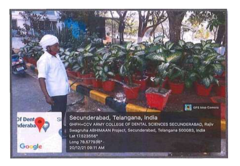
Fig-15: Waste water recycling — used for maintaining greenery