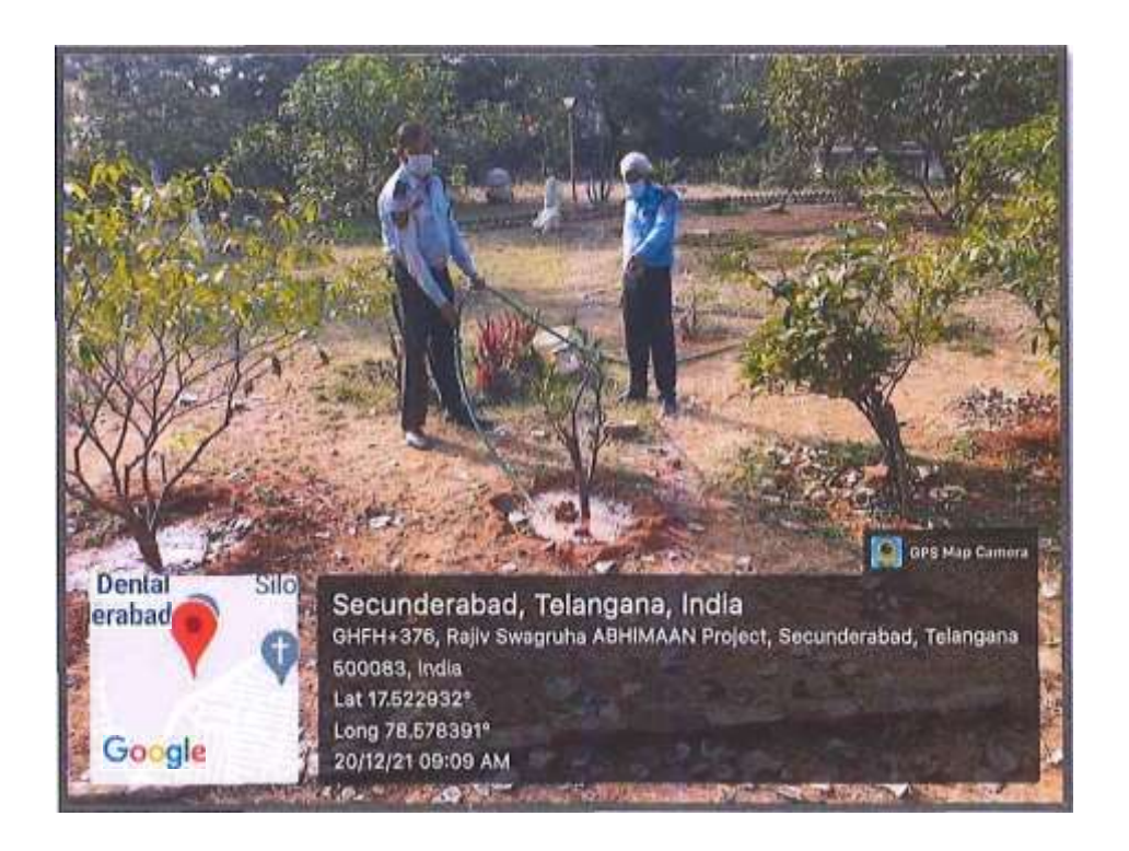
Fig-14: Waste water recycling — used for maintaining greenery

Website: <a href="www.acds.co.in">www.acds.co.in</a> Email: <a href="mailto:ANY c@rediflinail.com">ANY c@rediflinail.com</a> NAAC Accredited 'A' & Certified ISO 9001: 2015 & ISO 14001: 2015