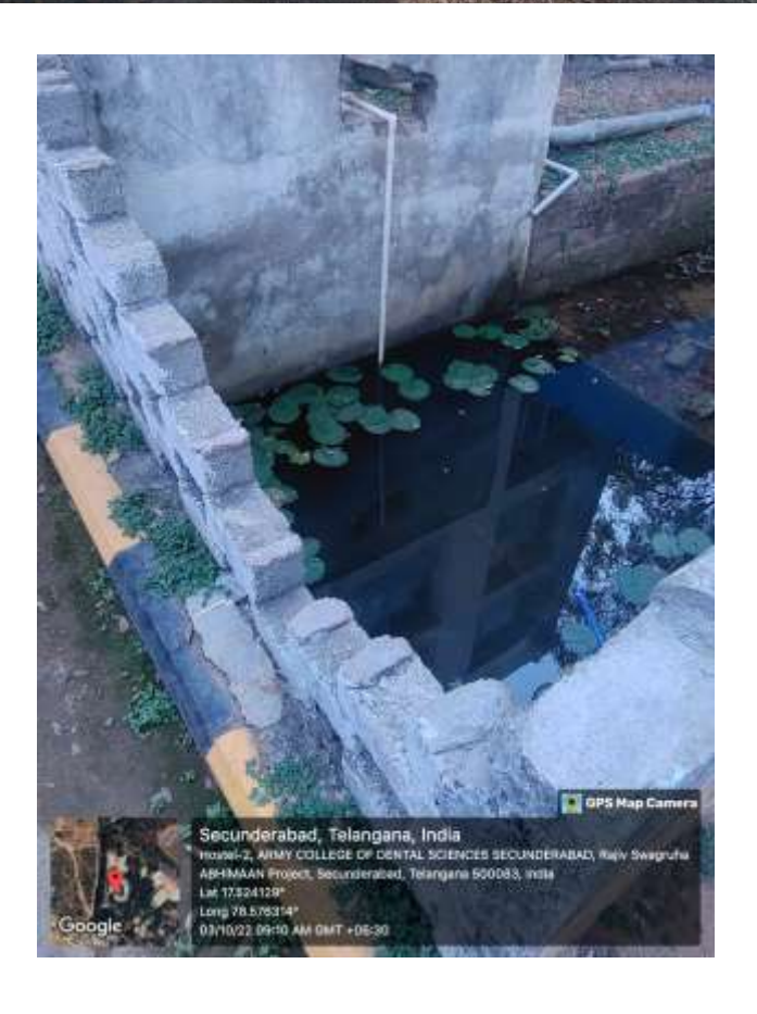
Fig-9: Water tank in the college premises