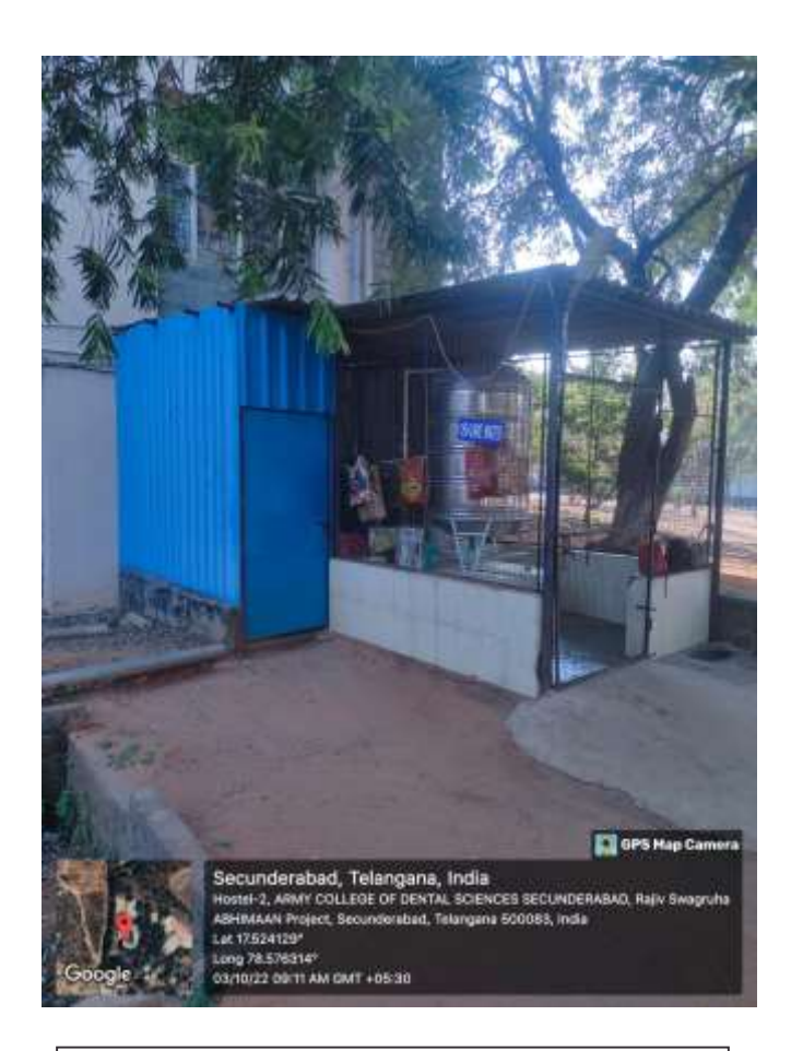
Fig-24: Save water signages