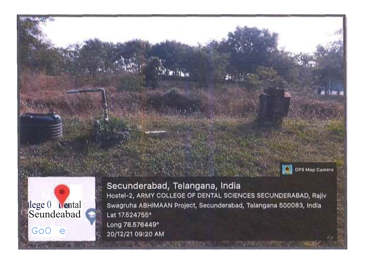
Fig-2: Bore well in the college campus

Website: <a href="www.acds.co.in">www.acds.co.in</a> Email: <a href="mailto:armY">armY</a> c@rediffinail.com</a> NAAC Accredited 'A' & Certified ISO 9001: 201S & ISO 14001: 2015