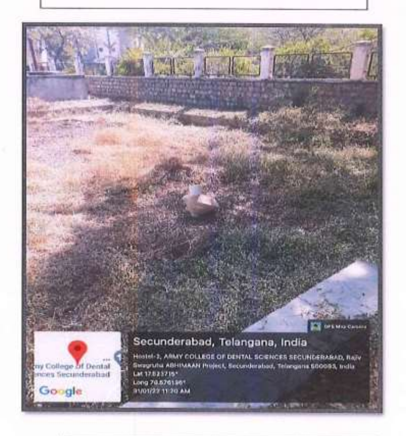
Fig-4: Bore well in the college campus