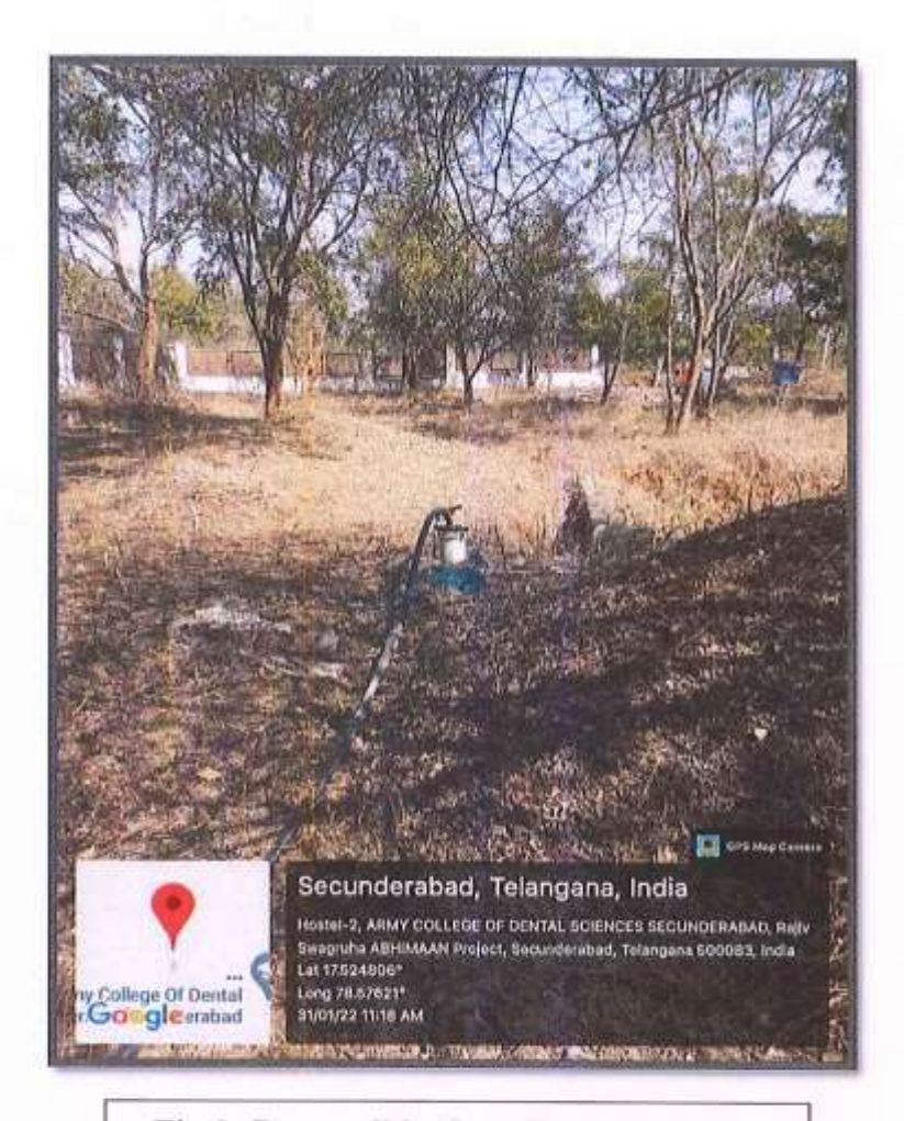
Fig-3: Bore well in the college campus