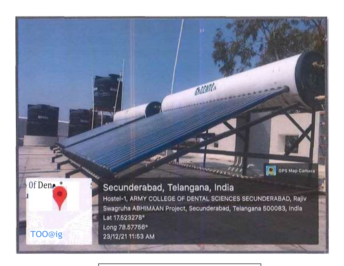
Fig-12: Water tank in girl's hostel