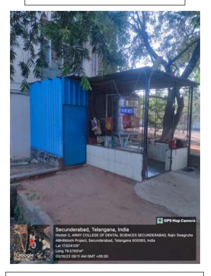
Fig-13: Water tanks and save water signage