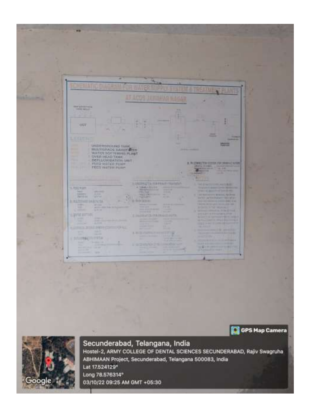
Fig-25: Schematic diagram for water supply system and treatment plans at ACDS