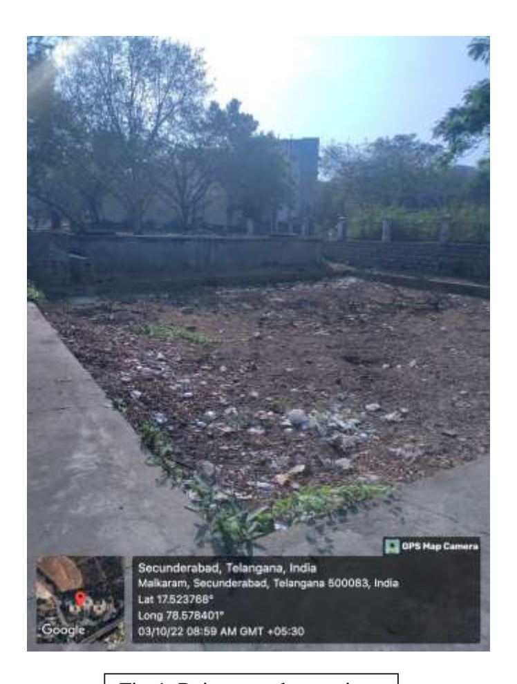
Fig-1: Rain water harvesting

Website: <a href="www.ncds.co.in">www.ncds.co.in</a> Email : <a href="army">army</a> c5],rer1iffmoi1.com</a> NAAC Accredited 'A' & Certified 1SO 9001 : 2015 & ISO 14001 : 2015