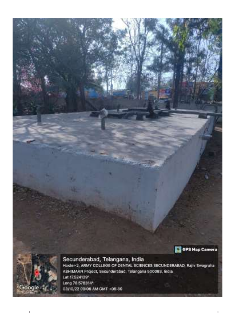
Fig-7: Water tank in the college premises

Website: <a href="www.acds.co.in">www.acds.co.in</a> Email: <a href="mailto:army.c@rediffmail.com">army.c@rediffmail.com</a> NAAC Accredited 'A' & Cei4ified ISO 9001: 2015 & ISO 14001: 2015