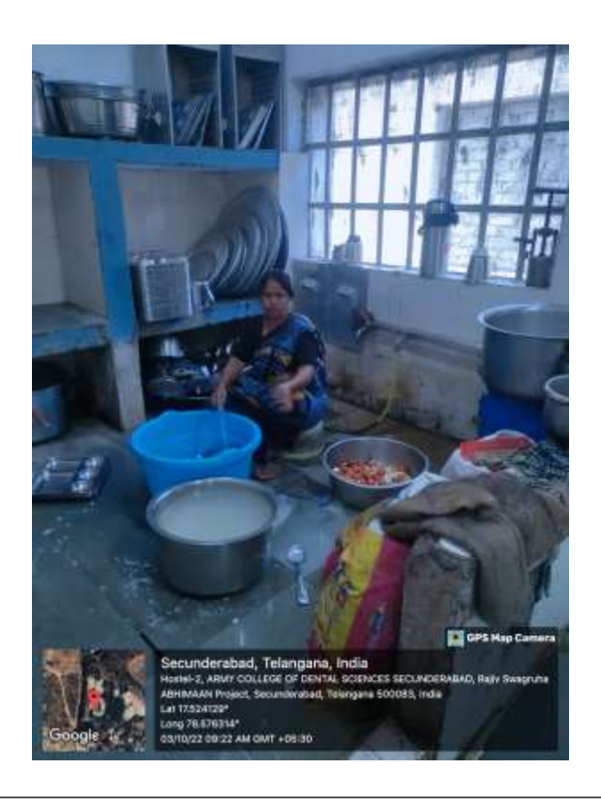
Fig-17: Waste water recycling — used for maintaining greenery