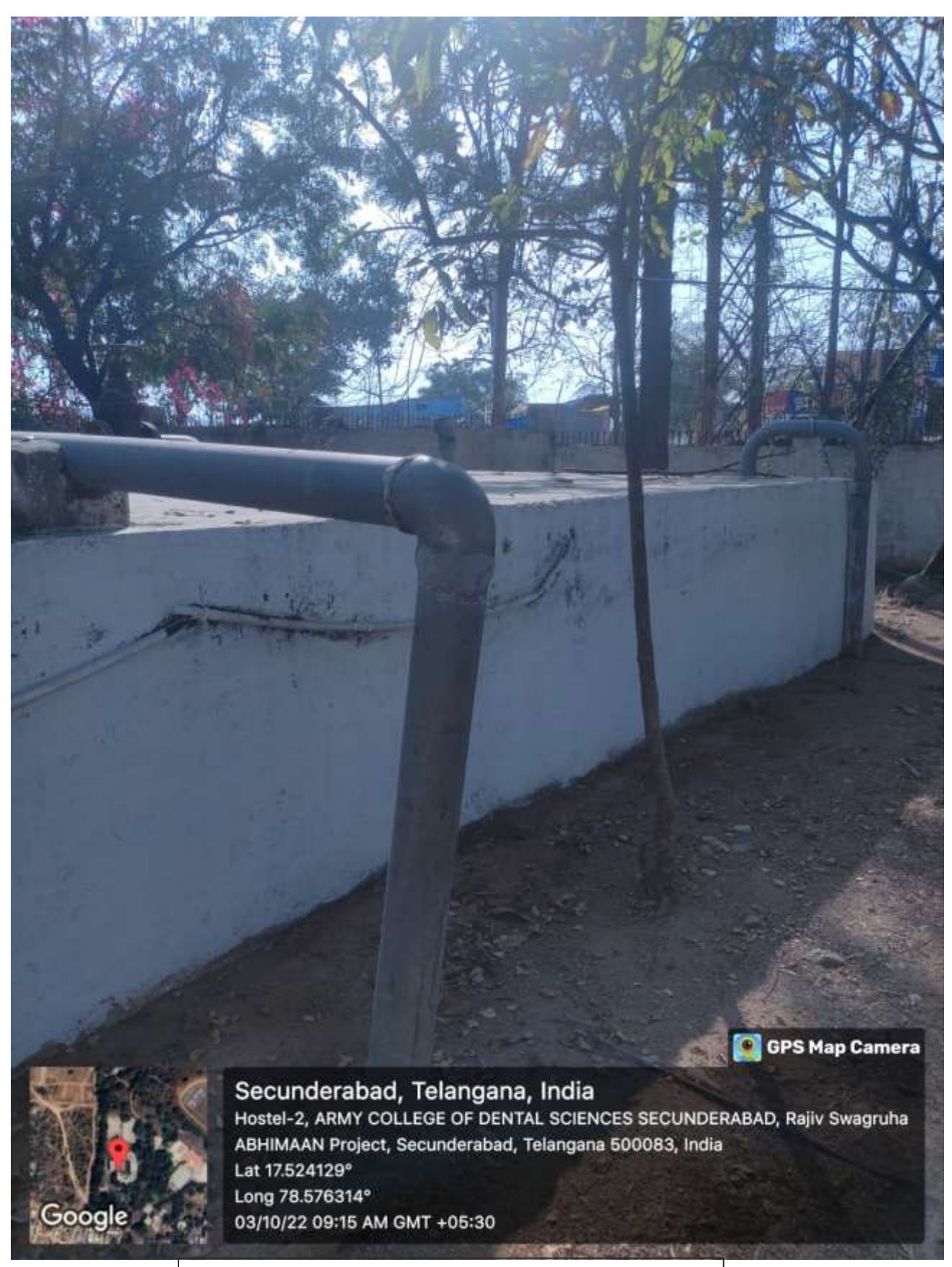
Fig- 19: Water pipeline distribution outside college